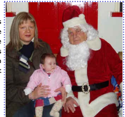
Donaghadee Club's Santa.

In the run up to Christmas its been a case of shoulders to the Rotary wheel for the members of Donaghadee Rotary Club. The members have been living up to the Rotary motto of Service Before Self as they acted as Santa and Santa's helpers at The Donaghadee Garden Centre and Dickson's Garden Centre during the past two weekends and again next weekend.