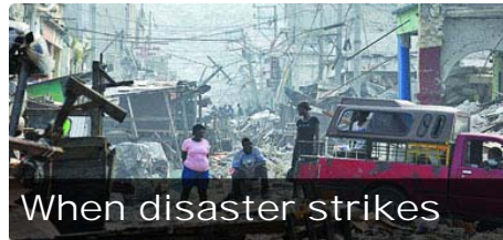
When disaster strikes

Oshkosh Morning Rotary Club, where the coffee pot is always on, and there is time to talk!