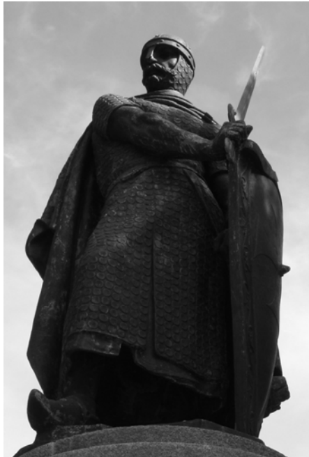
Alfonso I, first King of Portugal, Statute in St. Georges Castle in Lisbon